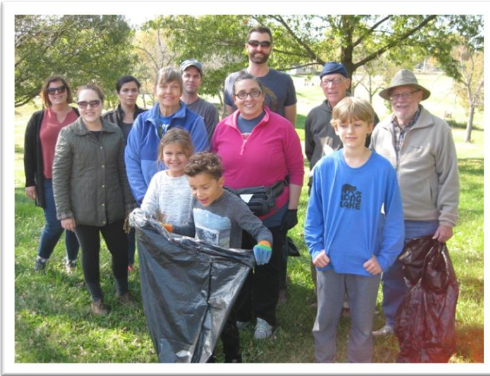
Oct. 26, 2019