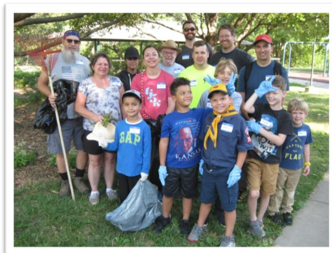
July 27, 2019